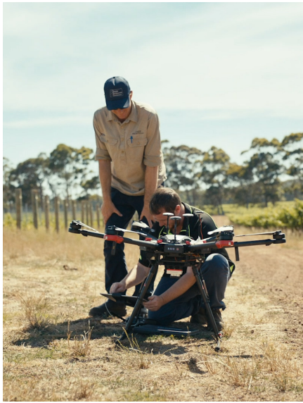
Keeping an eye on the vineyards with Cape Mentelle's all-seeing drone.

Fifty years ago when Cape Mentelle was established, vineyard management was a matter of walking the rows with eyes wide open, looking for growth and nutrient factors, and any pests and disease. Then the vineyard crew would descend to rectify trouble spots.