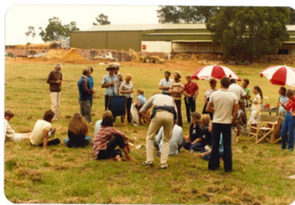
Field Games – Mentals vs Loonies 1986.