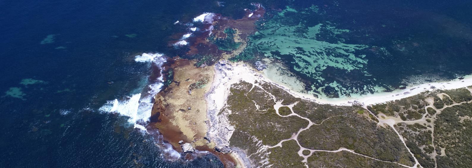
Bird's-eye view of Cape Mentelle meeting the Indian Ocean where petrels soar and waves break.

The newsletter of Cape Mentelle, Margaret River, Australia | ISSN: 2207-6964