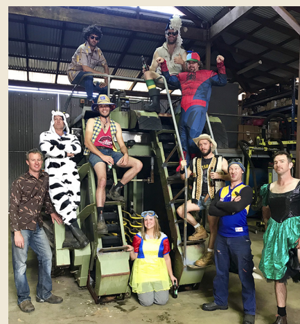
Tanks full. Time to party with the best-dressed Cape Mentelle Vintage 2019 crew!