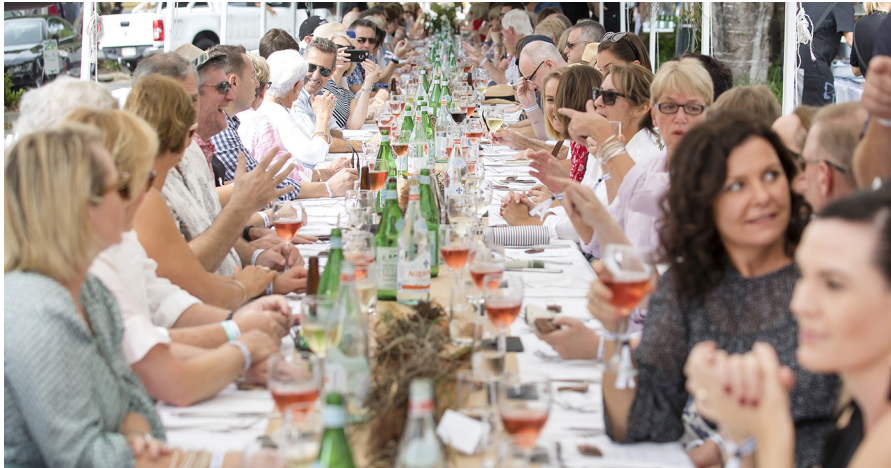
Out to lunch at the 2019 Noosa Food and Wine Festival with Cape Mentelle Rosé.