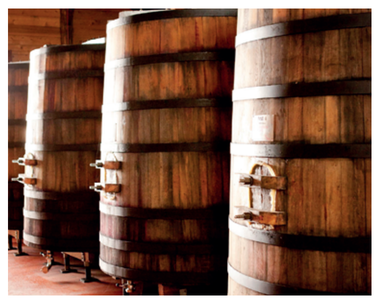
SUCCESSFUL INAUGURAL MITV SEASON DRAWS TO A CLOSE

We'd like to thank everyone associated with the wonderful feast of visual entertainment, fine food and wine that was 'Movies in the Vineyard' 2011. Over 10,000 visitors enjoyed outdoor movies in the Cape Mentelle winery gardens from December through to March 2011. The involvement and support of the local community was much appreciated and we look forward to doing it all again next summer.