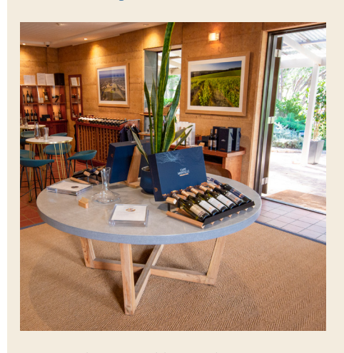
Warm welcomes and latest release wines await at the Cape Mentelle Cellar Door...

To join and for more details about the Cape Mentelle Wine Club options, please check the website. www.capementelle.com.au/wine-club Club members also have the option of customising their selections – your favourites, our treats and more. To do so, members are invited to log into their accounts and check the 'Club List' for all available wines. E: wineclub@capementelle.com.au