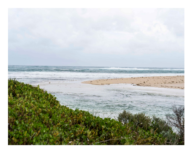
More hands make light work - Revegetation at Rivermouth team at the mouth of Margaret River.

Cape Mentelle is committed to its environmental and social responsibility strategies that are enshrined in CMV's recently acquired (and hard to achieve) ISO 14001:2015 certification. This best practice ISO standards program required an audit of the entire business – from vine to wine and even further – including Mentelle Notes . Have you noticed it is now printed on ecoStar+ 100% recycled post consumer waste paper? We also have a digital version.