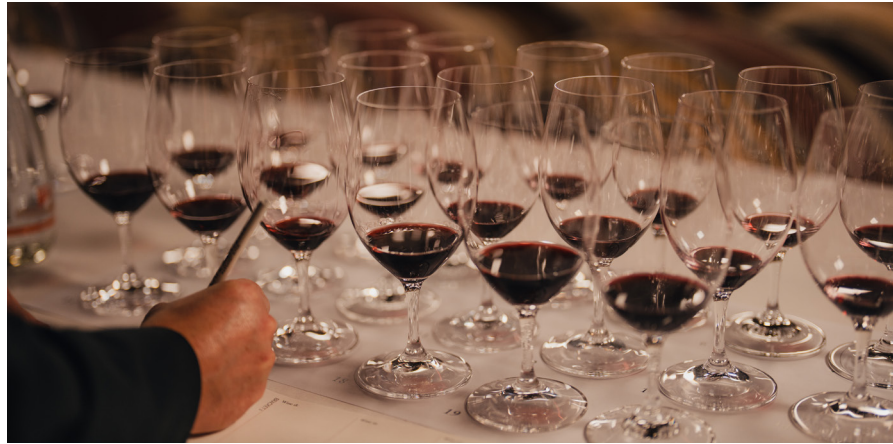
Glasses half full of Cabernet Tasting intrigue.

For the record, it was American Fred Ebb who wrote the timeless lyrics for Liza Minelli's signature song 'Life is a Cabaret' and we'd like to think both Liza and Fred would be happy morphing that sentiment to – Cabernet, old chum!