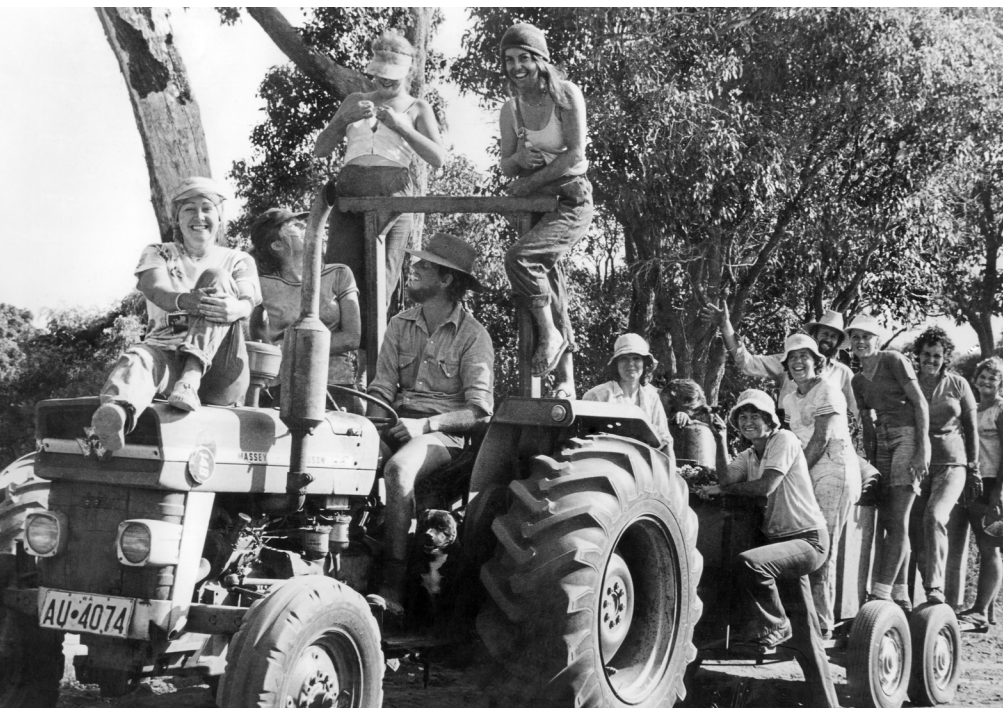
The Cape Mentelle Crew, Harvest 1983.

The newsletter of Cape Mentelle, Margaret River, Australia | ISSN: 2207-6964