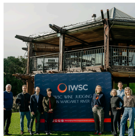
Margs impresses the 2025 IWSC judges.

We hope to welcome you and your travelling companions soon!