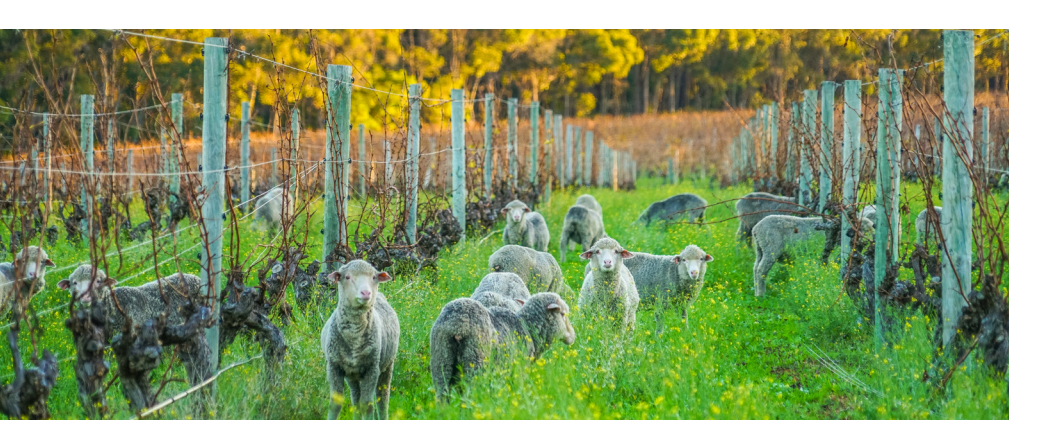
Where sheep safely graze - the original Cape Mentelle Wallcliffe Vineyard.

The newsletter of Cape Mentelle, Margaret River, Australia | ISSN: 2207-6964