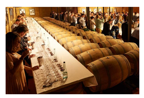
Cape Mentelle Cabs on taste.

The annual joining fee is $800 (inc GST) Details: www.capementelle.com.au/Wine-Club