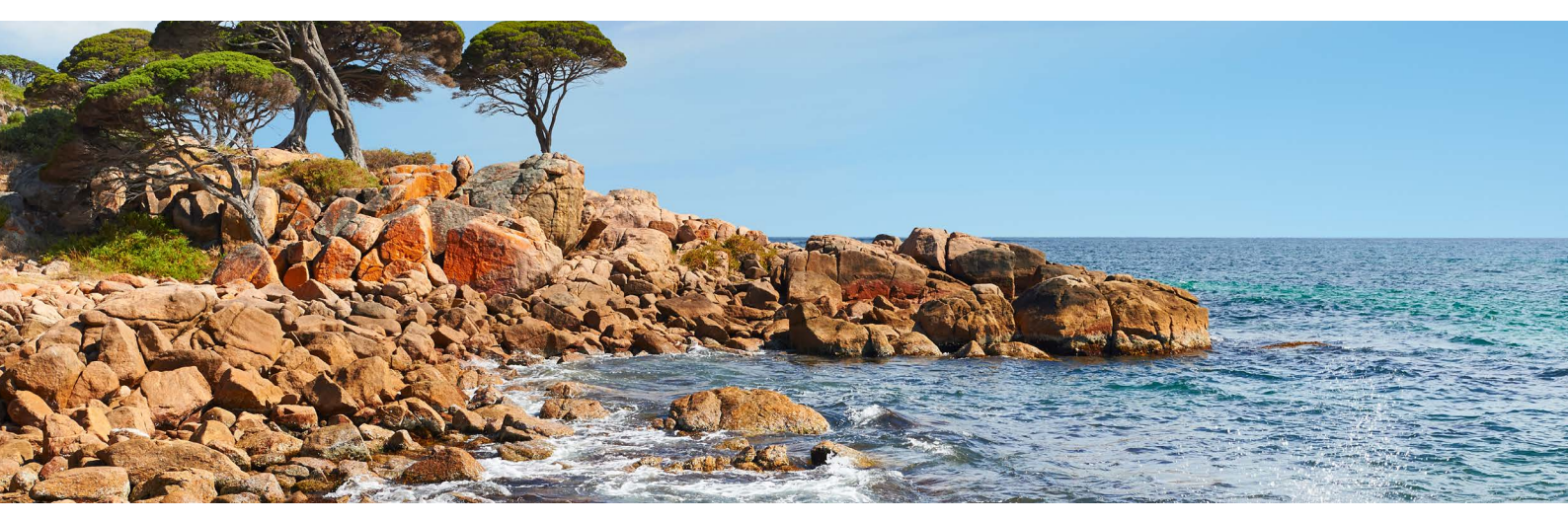
A sheltered cove on Margaret River's captivating coastline.

The newsletter of Cape Mentelle, Margaret River, Australia | ISSN: 2207-6964