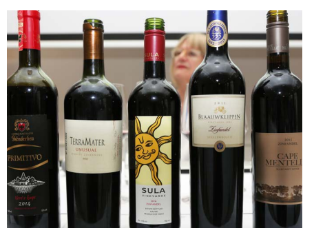
To be or not to be – Cape Mentelle Zinfandel lines up in Croatia.

According to the proud Croats, Tribidrag is an almost forgotten indigenous grape